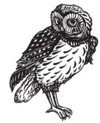
Darling Bird Studios, ©2007 UNA

___ Make a donation. Amount enclosed $_____