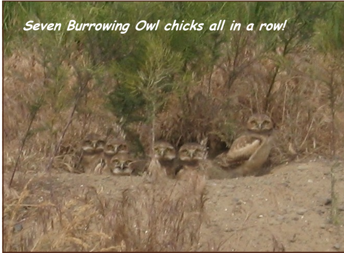
Seven Burrowing Owl chicks all in a row!